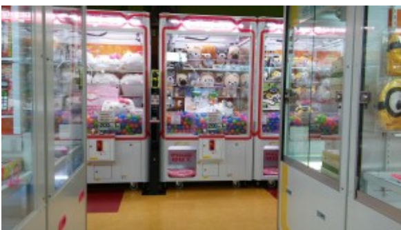
All this, with noise