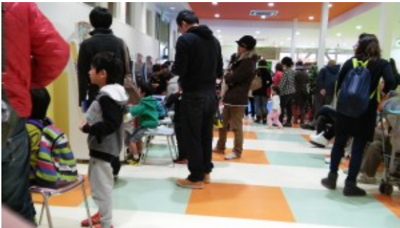
The children's arcade