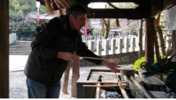
Preparing to enter Muko shrine