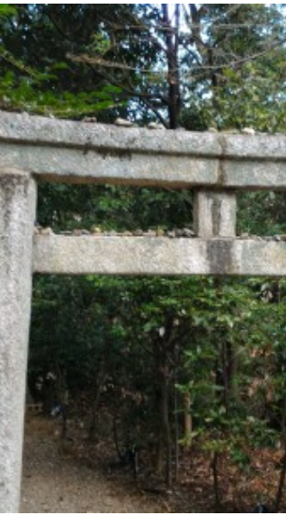
Stones on a torii at Muko shrine