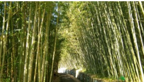
Rakusai bamboo park